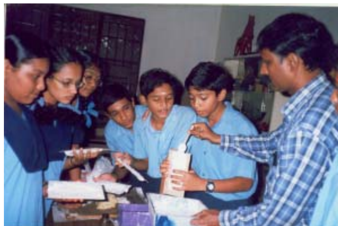
Students of std IX learning the process of moulding and casting using different materials like clay, concrete, plaster, cement, Fibre etc. The various skills learnt in this activity will come in handy for those who are planning to study medicine, architecture or sculpting in future.