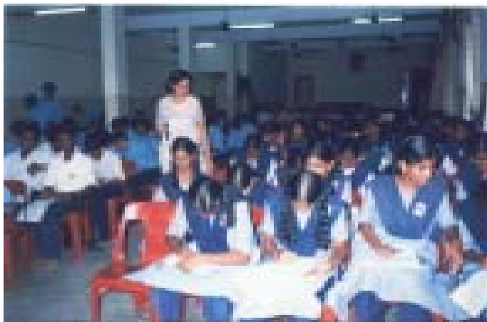
Class X students taking aptitude test