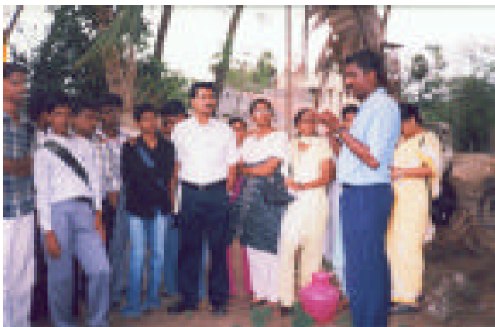
Technologist at EID Parry Sugar factory explaining the application of biotechnology in Sugarcane cultivation to XII Std. students on their recent trip to Pugalur.