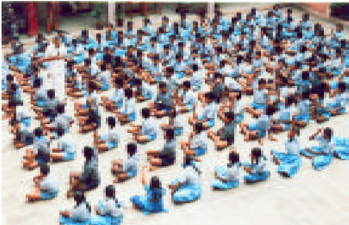
Students of Classes VII & VIII learning Graph in open air.