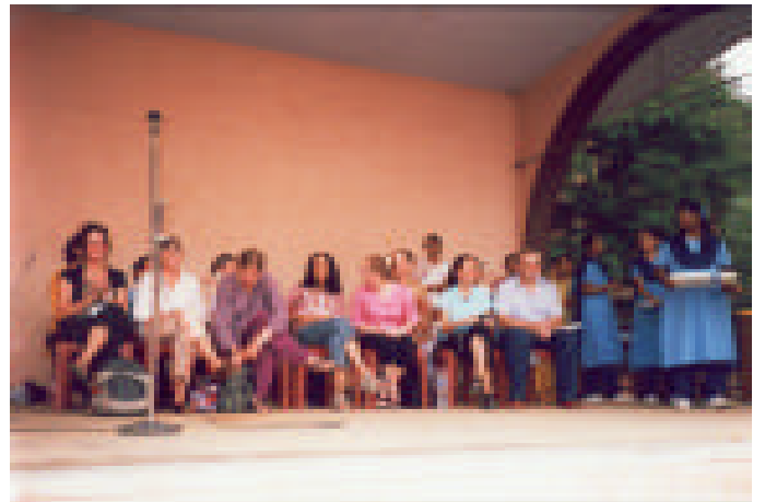
Guests on stage enjoying the sports events