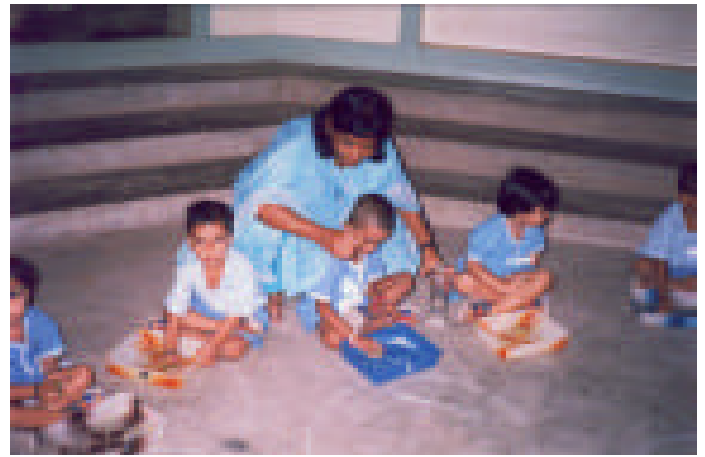
Firming up the little Fingers

So, moms! next time if your little ones insist on helping you in the kitchen let them do it. It's worth the mess.